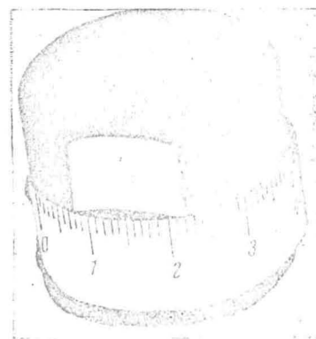
Fig. 3. Crystal of CdS.